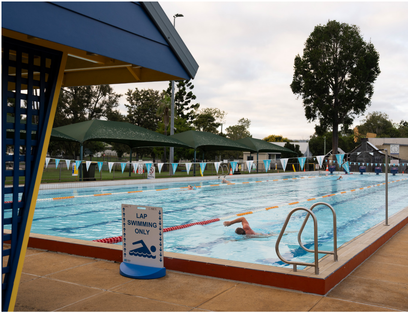
Beaudesert Swimming Pool