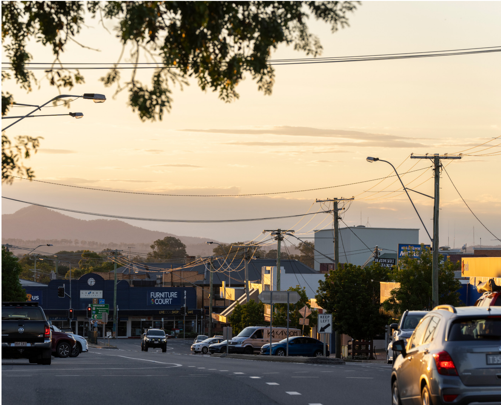
William St, Beaudesert