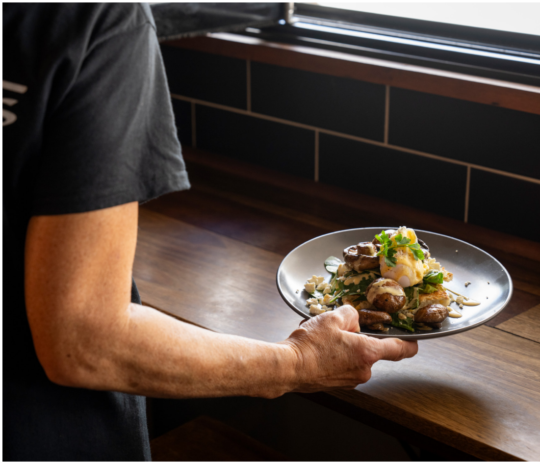
VK Everyday's Beaudesert