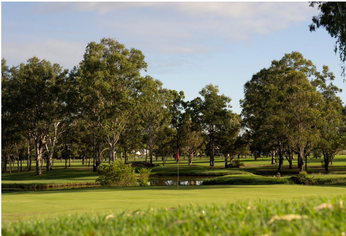
Beaudesert Golf Club